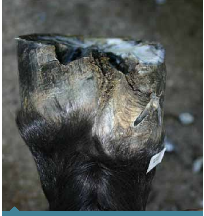
FIG 6. A 'V' WAS CUT INTO THE HOOF TO DISSIPATE ANY MOVEMENT AROUND THE CRACK

The 'shunted' medial heel is evidence of the greater loading taken on the medial heel and may be a cause of pain in its own right. Floating or beveling the heel is a simple and effective method of reducing the loading on this area of the hoof. Removal of the shoes may not suit all horses or their owners but should be considered as an option as the shoe may well be contributing to the medial heel being overloaded. Although this horse did not seem to have an unlevel footfall, it definitely did overload its medial heel. Horses with an underlying conformation fault that predisposes them to have a lateral side first footfall are at a higher risk of forming a medial heel quarter crack.