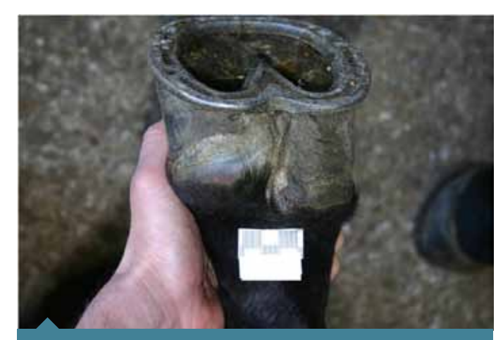
FIG 4. THE MEDIAL HEEL BULB WAS DISPLACED UPWARDS