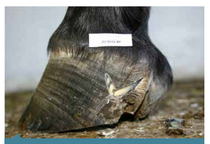
FIG 5. A NEW QUARTER CRACK FORMED ON THE MEDIAL HEEL OF THE RIGHT FORE

that the medial heel bulb was much higher than the lateral heel bulb with the centre line of the frog distorted.